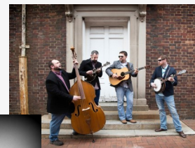
DEER CREEK BOYS