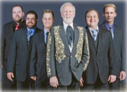
DOYLE LAWSON & QUICKSILVER