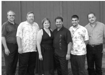
ALL 4 HYMN - Thursday, 21st