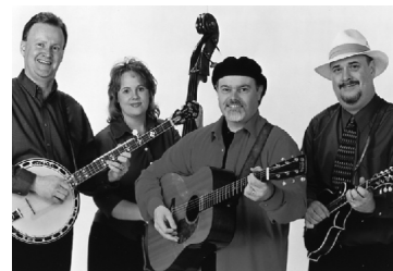
WILLIAMS & CLARK EXPEDITION Thursday, 21st & Friday, 22nd