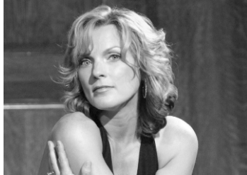
RHONDA VINCENT & THE RAGE Saturday, 23rd