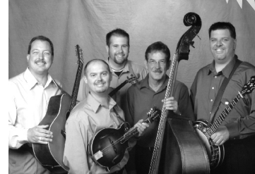
Illrd TYME OUT - Friday, 22nd