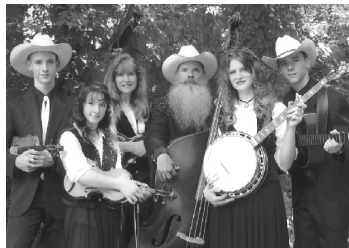
CHERRYHOLMES Friday, 22nd