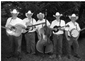
THE BLUEGRASS BROTHERS Friday, 22nd & Saturday, 23rd