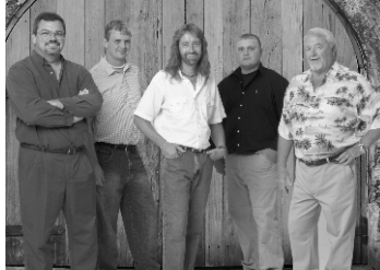
NOTHIN' FANCY - Thursday, 21, Friday, 22nd & Saturday, 23rd