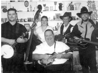
In The Tradition - Friday, 25th