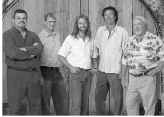
Nothin' Fancy - Thursday, Friday & Sat. Sept. 24th, 25th, 26th