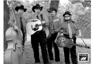
Country Fried Grass - Saturday, 26th