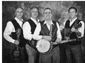
Wonder - Thursday, 24th