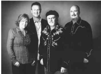
Williams & Clark Expedition Thursday, 24th & Friday, 25th