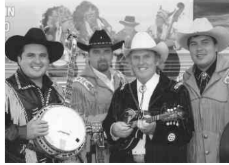
Goldwing Express - Thursday, 24th