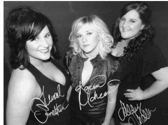
Next Best Thing - Saturday, 26th