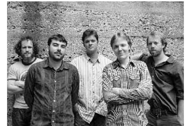
Steep Canyon Rangers - Thursday, 24th