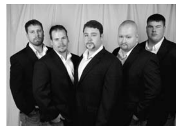
Allegheny Blue - Saturday, 25th