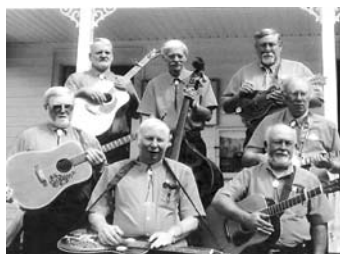
Little Mountain Boys - Saturday, 25th