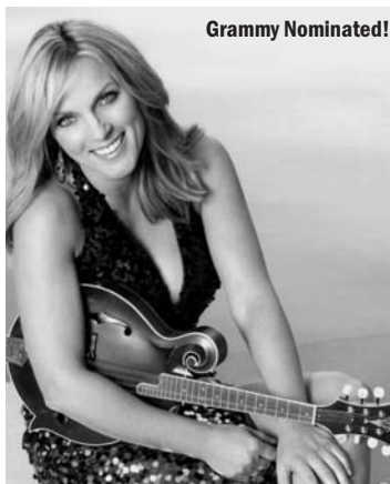
Rhonda Vincent - Saturday, 25th 7-time IBMA Female Vocalist

Glen Maury Park - 10th St. Buena Vista, VA September 23, 24, 25, 2010