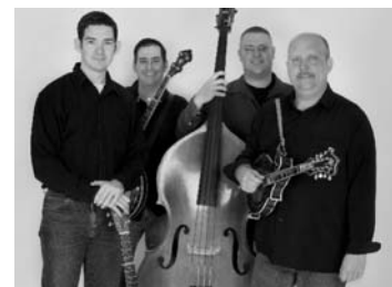
Lonesome Highway - Thursday, 23rd