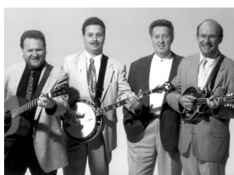
Lost and Found Friday, 24th