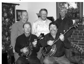
Plain & Simple - Friday, 24th