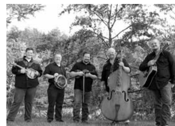
Bluegrass Brothers - Saturday, 25th