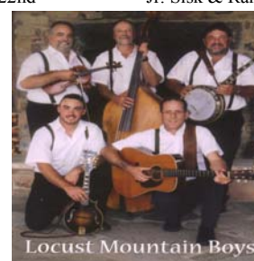
Locust Mtn. Boys - Saturday, 24th