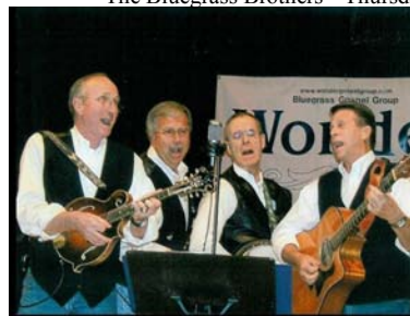
Wonder - Thursday, 22nd & Saturday, 24th