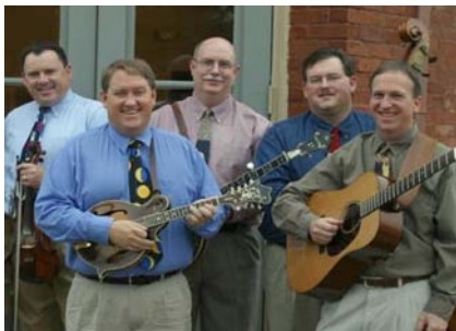
The Blinky Moon Boys - Friday, 23rd