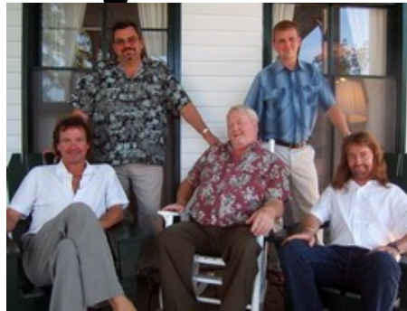
Nothin' Fancy - Thursday, Friday & Saturday