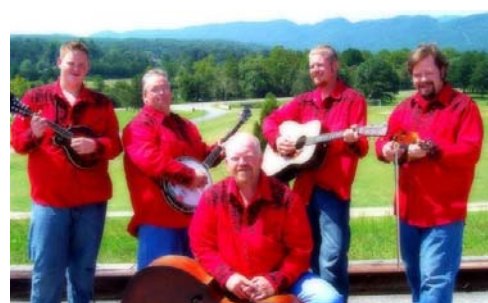
The Bluegrass Brothers - Thursday, 22nd