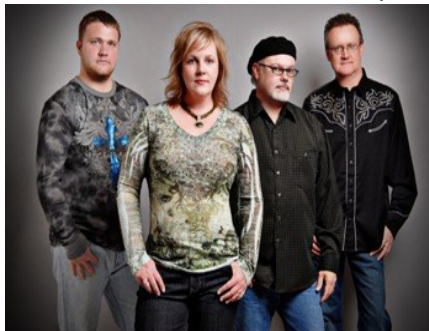
The Expedition Show - Thursday 22nd